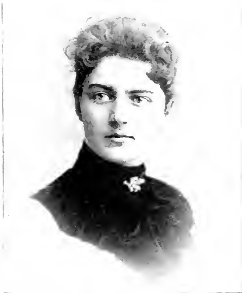
FRANCES FOLSOM CLEVELAND.